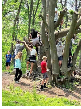
8th Grade Trip